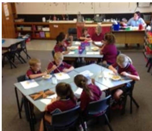
Art and Craft.