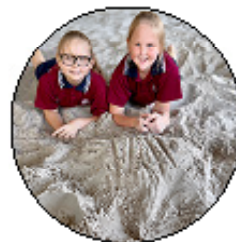
Build skills through fun